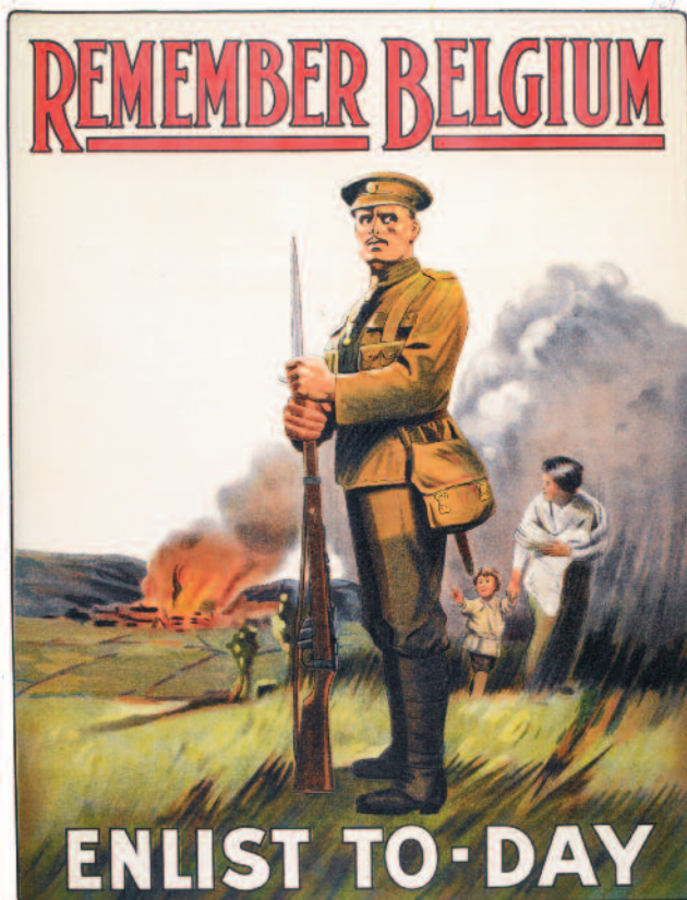
Poster from the excellent and wide ranging Propaganda, power and persuasion exhibition at the British Library. The exhibition explores the strategies of state propaganda from the early 20th century to the present

clearly thought-out objectives, the newest weapons system to hand may distort understanding of what objectives are worth pursuing. Could that be happening here? It is one thing if Obama is killing only those who have the intention and capacity to massacre Americans. It is quite another if he is dealing out death in pursuit of ordinary foreign policy goals because it has become so mercifully easy to do. The CIA, a Secret Army and a War at the Ends of the Earth. Mark Mazzetti Penguin 2013