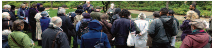
May 15 2013 at the CO stone London

Accounts of the treatment of some COs in prison and elsewhere bear disturbing echoes of the brutality of some members of the armed forces today to prisoners in Iraq and Afghanistan (as well as to young recruits). 'The most extreme instances of deliberate and organised cruelty against conscientious objectors occurred at Dingle Vale training camp in Liverpool and Ilfracombe training camp in Devon.' When details